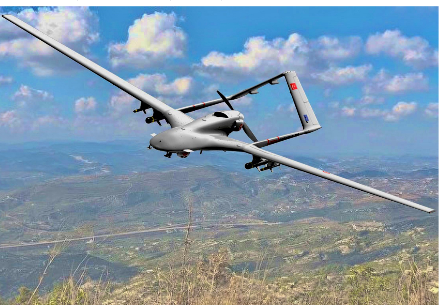
Turkish Bayraktar TB2 drone.

the next decades, and neural network computing will, by around 2040, attain something like human-level intelligence.<sup>68</sup> There will be a development where robots are equipped with processors with Al. It will initially be in the form of a limited capacity with clear human control, but down the line, we will leave more and more decision-making to Al, thereby reducing the reaction time.