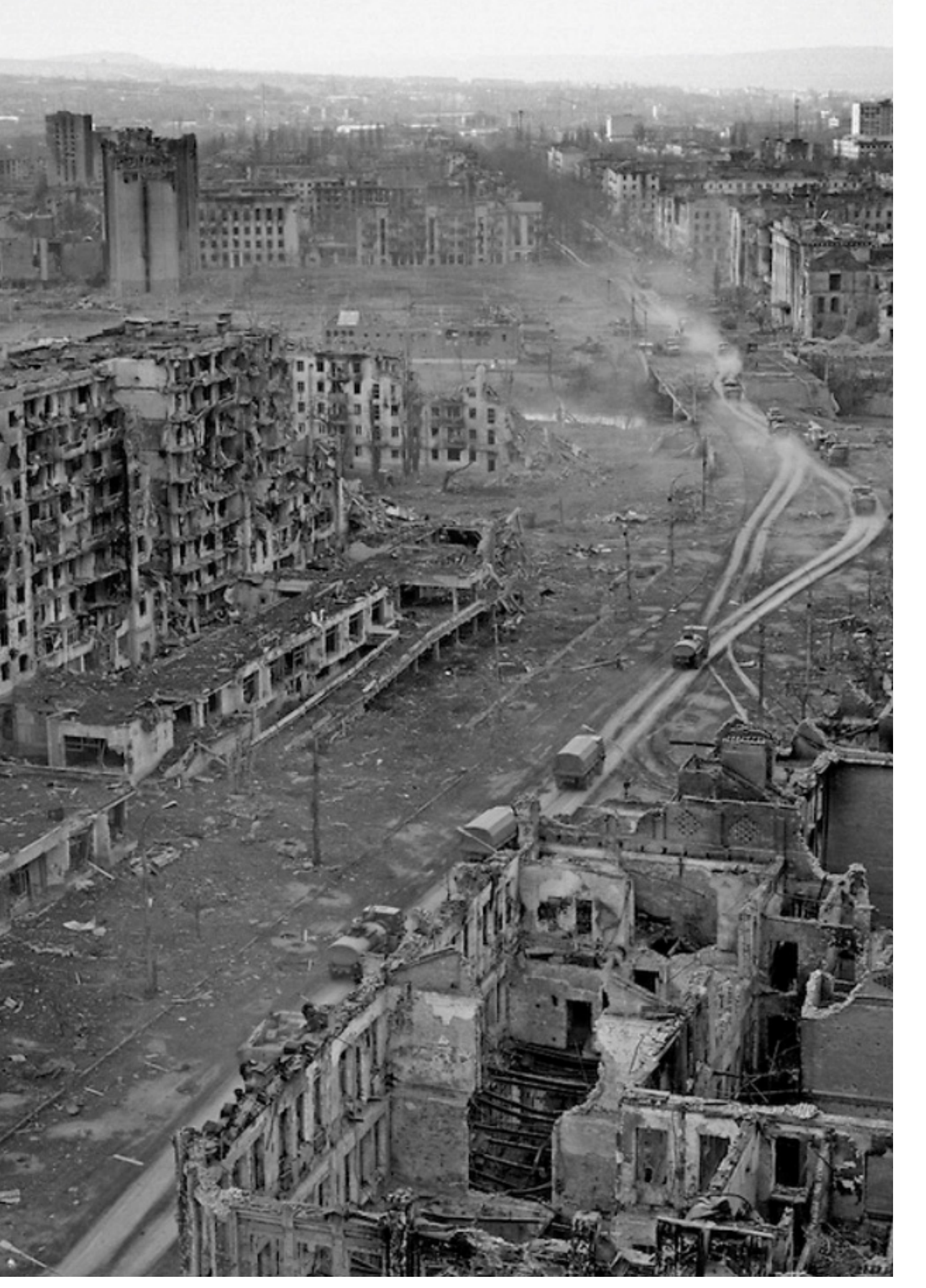
Grozny after the Russian attack.