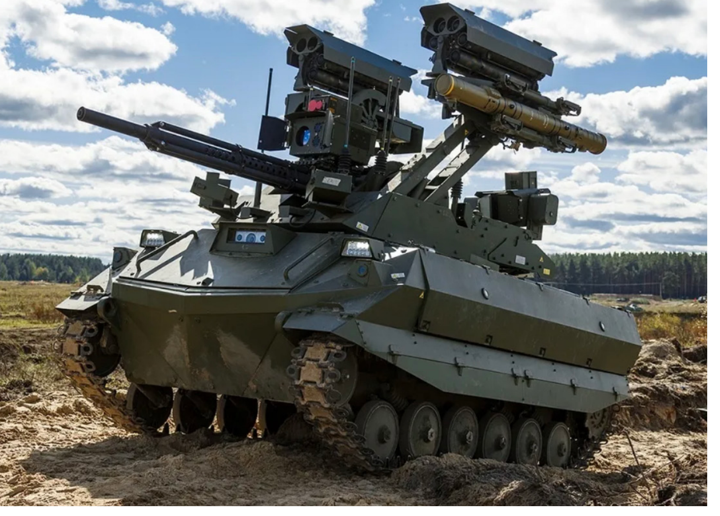
Nerekhta Unmanned Combat Ground Vehicle.