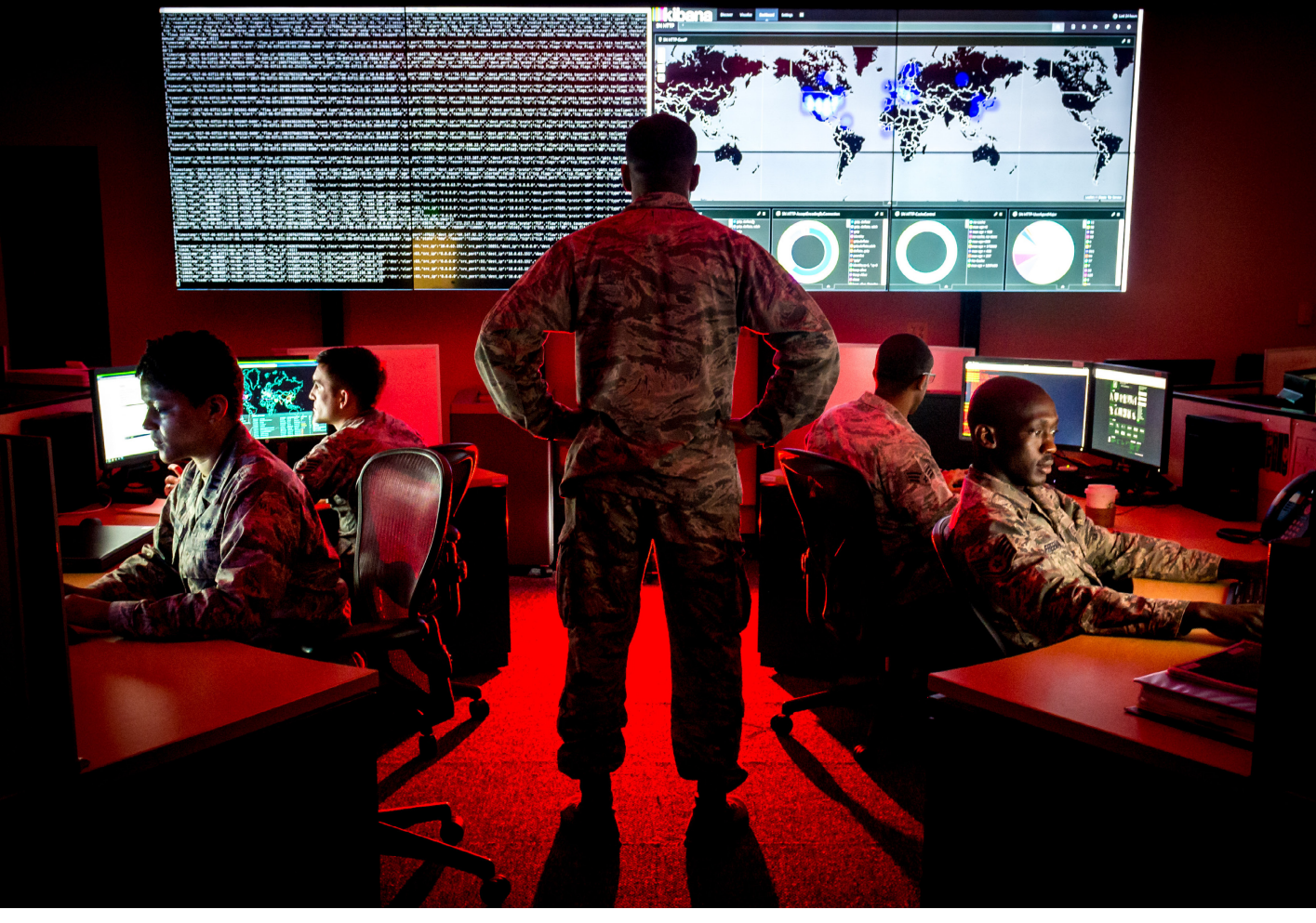
Cyberwarfare specialists serving with the 175th Cyberspace Operations Air Force

A robot is a machine with three interacting components: Sensors, processors (that can be Al) and effectors. It follows that robots can be