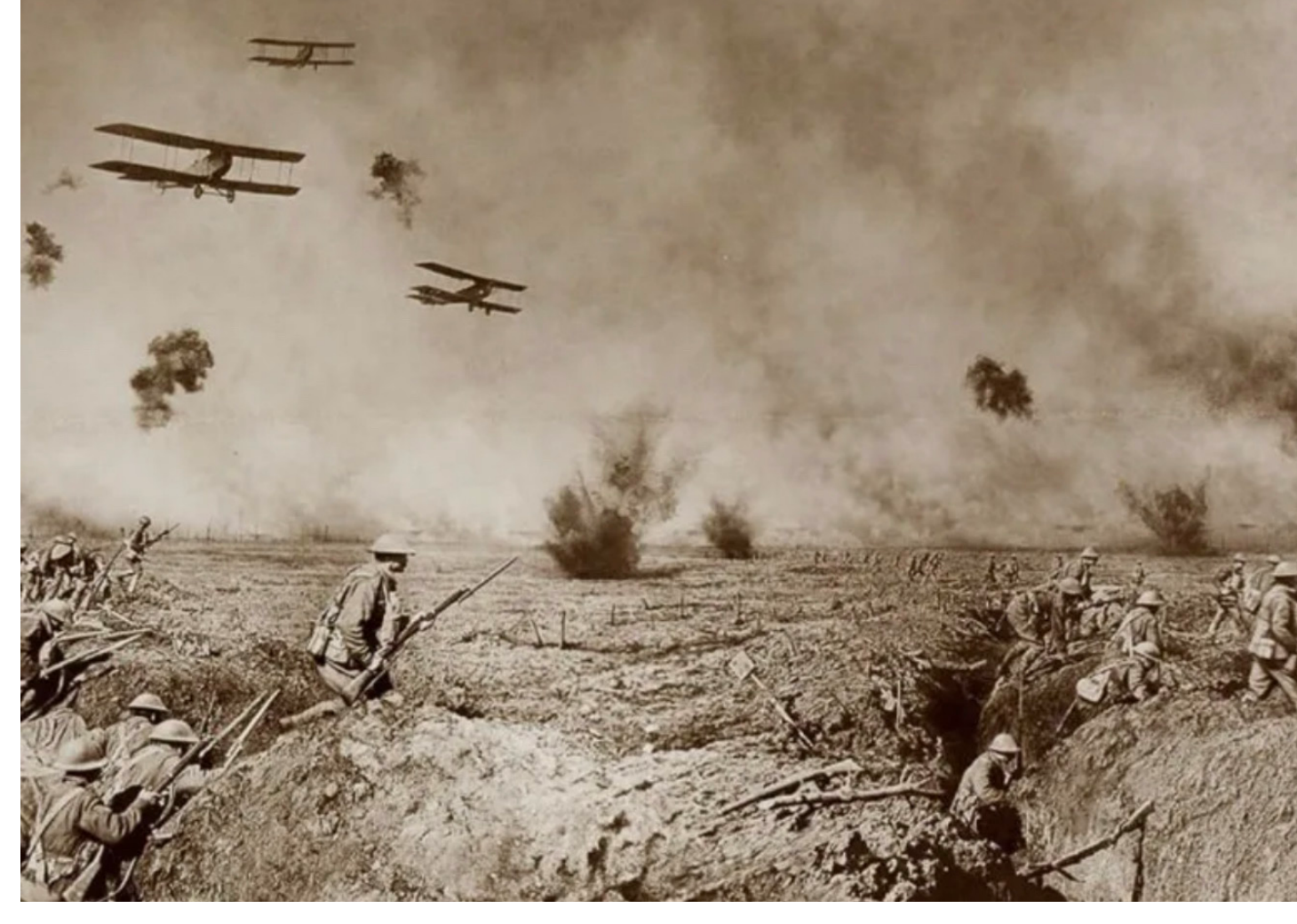
World War I changed war in the same way we can see it in the future. New military domains emerged, and at the battlefield, soldiers witnessed these changes.

The purpose of war will not have changed in 2040: 'War is thus an act of force to compel our enemy to do our will.' However, the means available to force our enemy's resolve will have changed. One of the best examples to help us understand this change in the means is the military revolution of the First World War. This war fundamentally changed